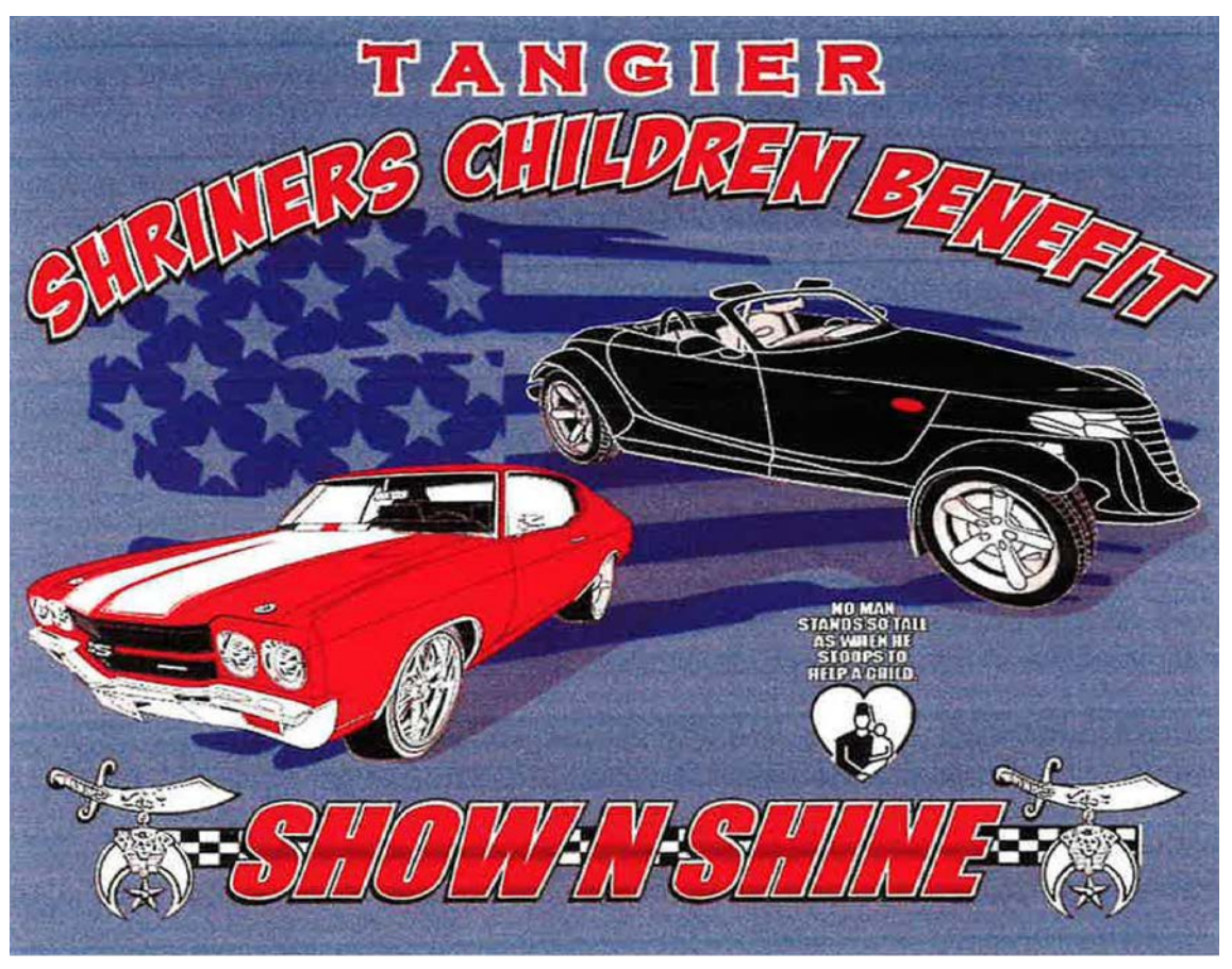
June 4, 2023

All proceeds go to the Shriners Hospitals for Children and are tax deductible.