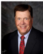
Founder / President